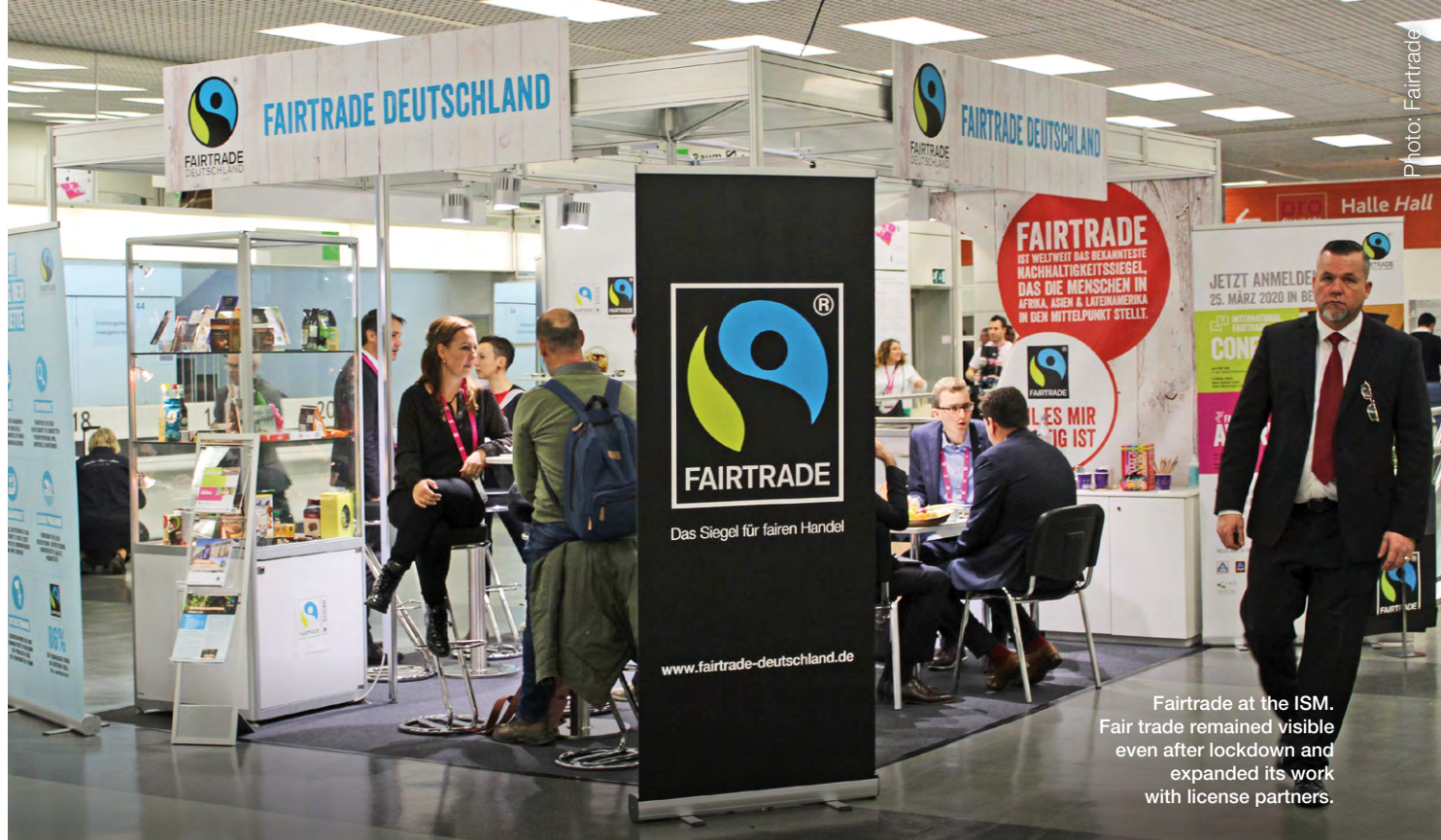
Fairtrade at the ISM. Fair trade remained visible even after lockdown and expanded its work with license partners.